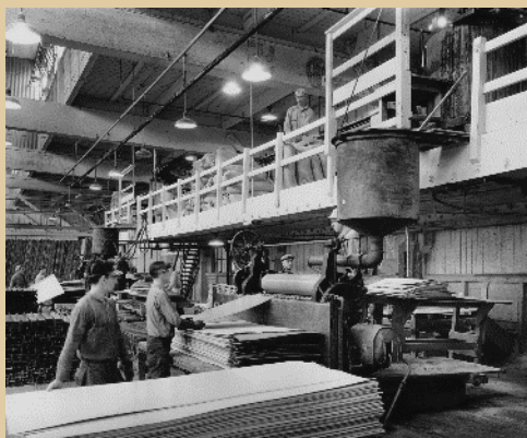
Veneer sheets fed into glue roller; glue hopper above