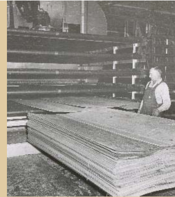
Veneer sheets cut into lengths & dried