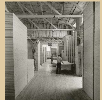
Stored to dry before shipping