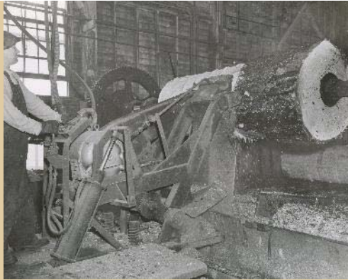
Log bolts were cut to length, peeled and smoothed