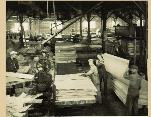
Dried veneer sheets stacked with alternating grain