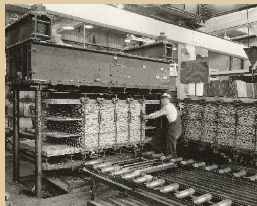
Glued sheets joined under high pressure